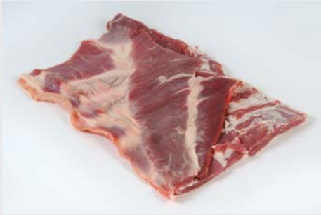
1. Position of the breast.